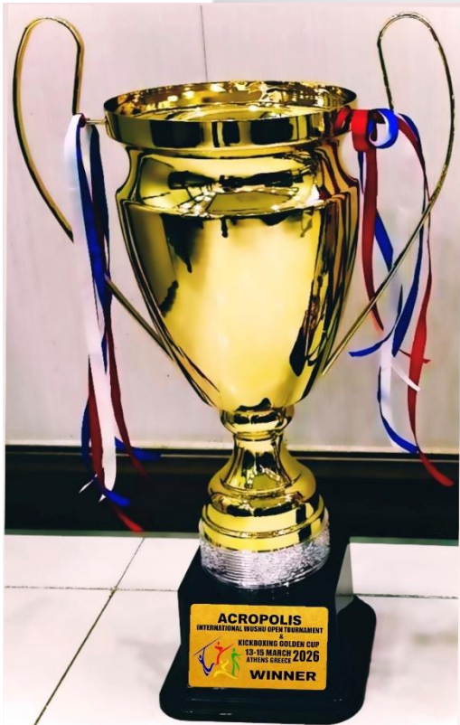
METAL CUP 60 cm