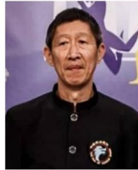
Master Tang Tung Wing 7 Duan of Chinese Wushu