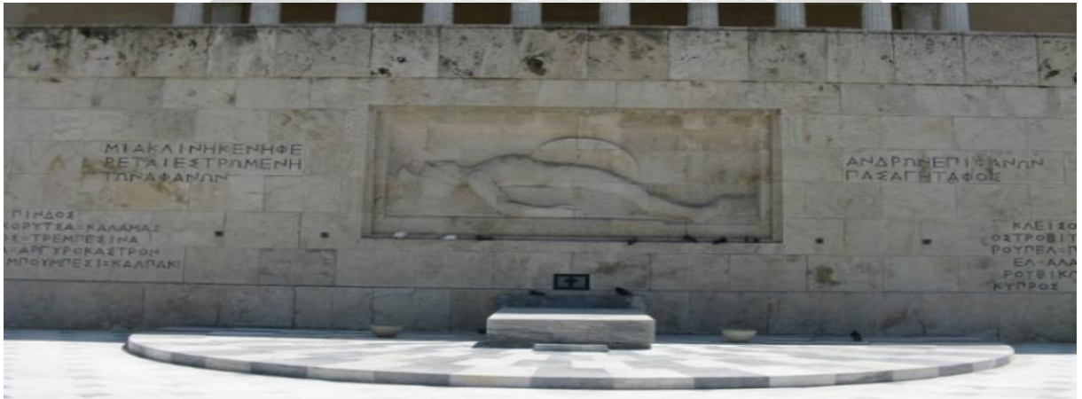
The House of Parliament with the tomb to the Unknown Soldier