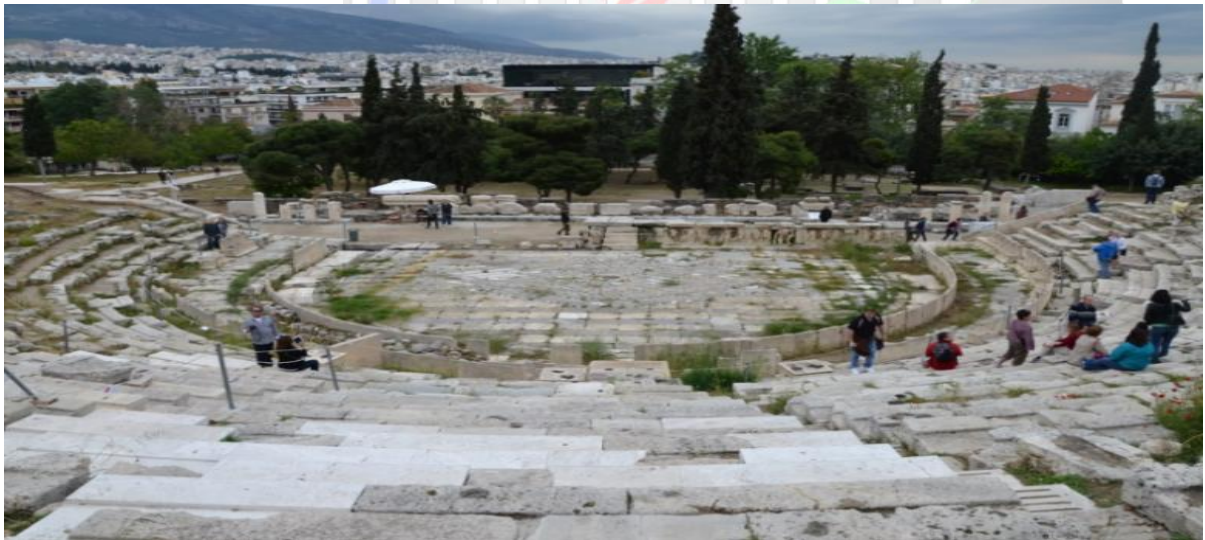
The Theater of Dionysus