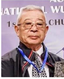
Grand Master Wu Bin 9 Duan of Chinese Wushu