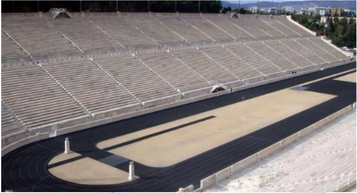
The Panathenaic Stadium