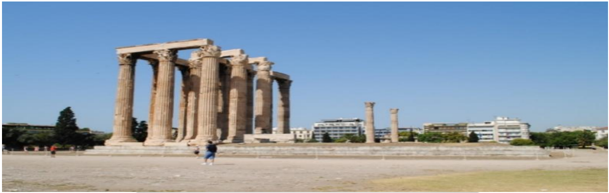
The Zeus Temple